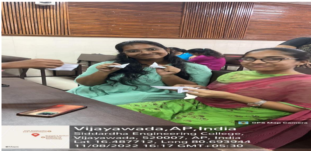
Students discussing and participating actively in the event.